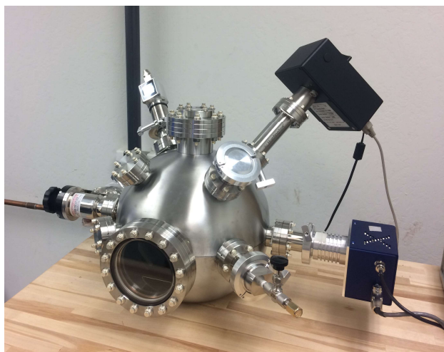
Figures 1. and 2. Moxtek BX-1 window and experimental apparatus at XEI Scientific Inc.